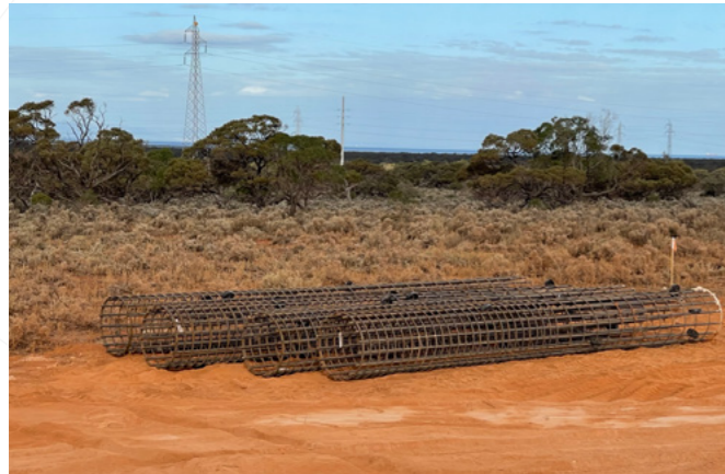
Concrete reinforcing stockpiles in the laydown yard