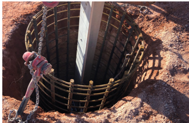
Foundation preparation of tower leg